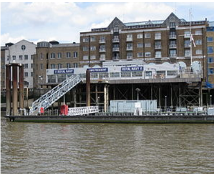
Shore establishment HMS PRESIDENT .

Metropolitan police station on the river, just down from HMS President , then past Surrey Docks we continue downstream to the mooring for our overnight stay at Greenwich Sailing Club. Still looking for the sailing club at Greenwich, and the sun is going down.