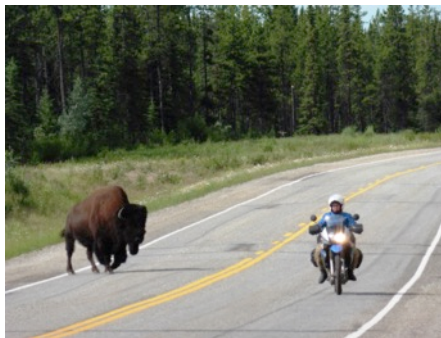
and a narrow shave!