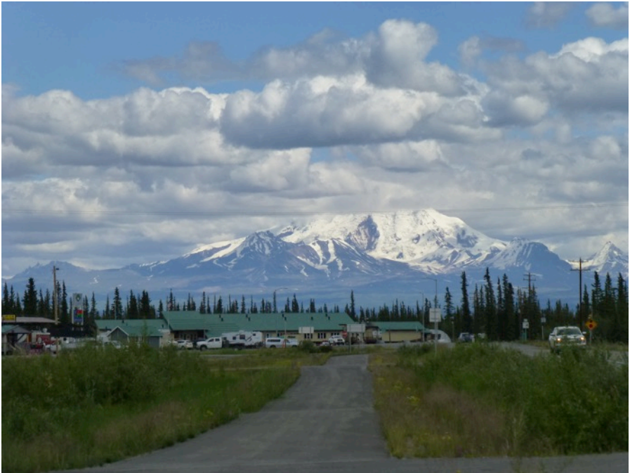
Mount Wrangell from the Alaska Highway