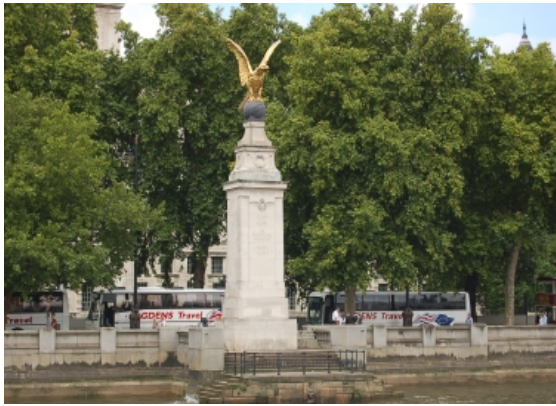
The Royal Air Force Memorial Eagle has stood on the banks of the river since 1923