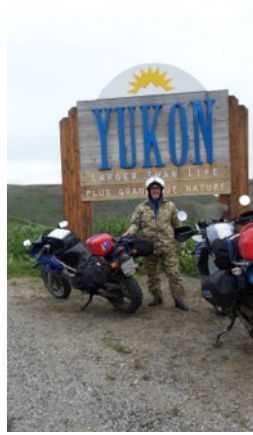
A summer hailstorm in British Columbia and entering the Yukon Territory from Alaska