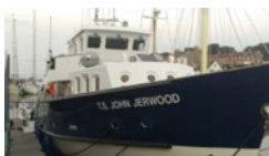
T.S. John Jerwood