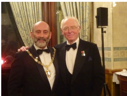
Current and former Presidents

Trafalgar Dinner, 20 th October 2016 – Attendees 88