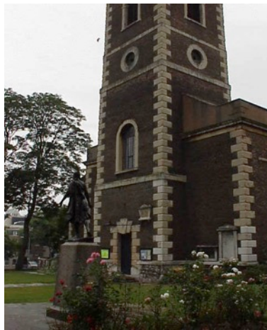
We found her at St. George's Church

We had full English for breakfast - cooked by a man from Poland but all was good.