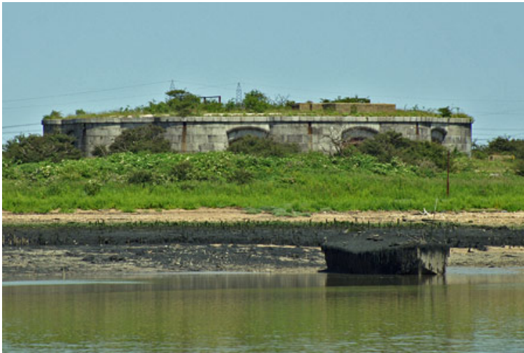
The Medway River Fort

We reached the mouth of the Medway with time on our side, and followed the mouth of the river keeping an eye on the depth. We continued - true to the starboard down the middle of the Medway we went. "Still some way to go" said Roger as he sipped on a beer. He also pointed out the tide was falling fast. We both spoke about times we had run aground in the past. We still had some way to go before we reached the destination for the day, and where Roger's good lady was picking us up later that day after we had washed the boat down.