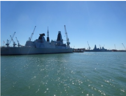
HMS Diamond and HMS Daring