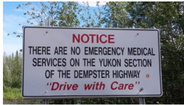
Two 70 year olds at the Dempster Highway – not for the faint hearted