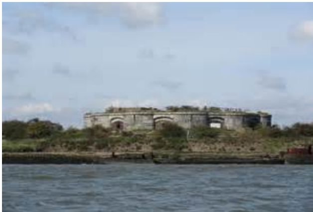
Fort Hoo in the middle of the river Medway

We reached the mouth of the Medway with time on our side, and followed the mouth of the river keeping an eye on the depth. We continued - true to the starboard down the middle of the Medway we went. "Still some way to go" said Roger as he sipped on a beer. He also pointed out the tide was falling fast. We both spoke about times we had run aground in the past. We still had some way to go before we reached the destination for the day, and where Roger's good lady was picking us up later that day after we had washed the boat down.