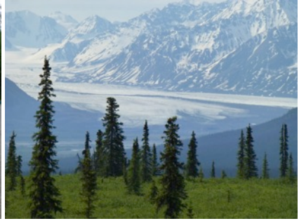
The Matanushka Glacier