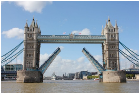
Looking back at the pool of London and HMS BELFAST in the distance

We continue past the House of Commons. I know all the buildings on the river bank, but today I am watching the river traffic. And then I saw a bridge you all know; yes I am at the helm of a boat going under TOWER BRIDGE for the first time in my life.