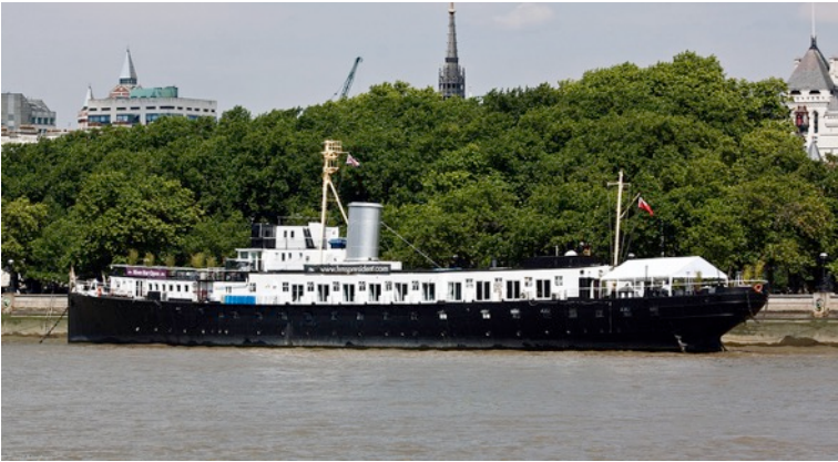
PRESIDENT 1918 moored on the embankment.