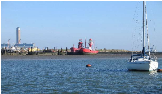
Looking backwards to Kings North power station on the Medway