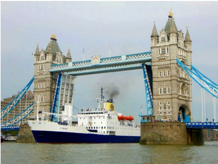
RMS St. Helena passing under Tower Bridge