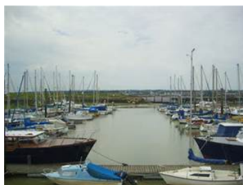
The barge we moored against, and this is Hoo Marina