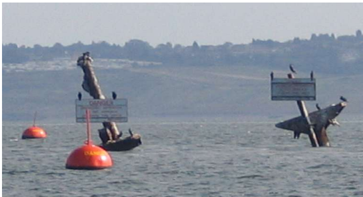
The wreck of ss Montgomery - A 3,000 ton time bomb

Now we were off to the River Medway, but first The London Gateway Port. The Thames is very wild at this point; we keep to the shipping lane and off the mud banks, checking for low water, both keeping a lookout.